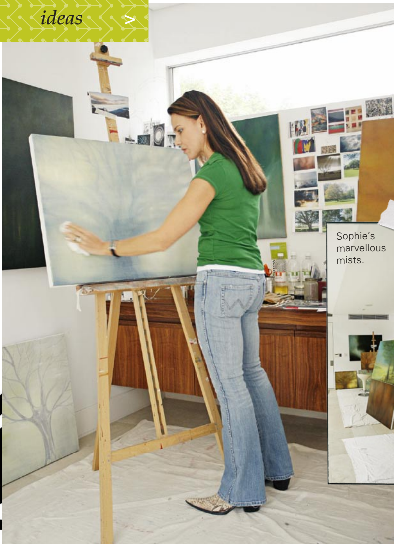
Sophie's marvellous mists.